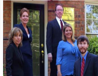
The Gartzman Law Firm Team!